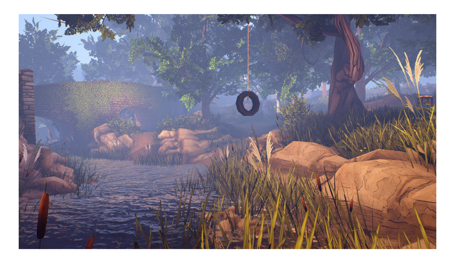
CRAFT: Work VR Shop Activation Code [key Serial]

Download ->->-> <a href="http://bit.ly/2SLNepL">http://bit.ly/2SLNepL</a>